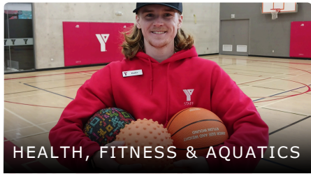
HEALTH, FITNESS & AQUATICS

We're known for our gym, fitness centre and beautiful pools, but even though it's our largest building, that is just a small part of what the YMCA offers the community. The YMCA of Owen Sound Grey Bruce also delivers a wide variety of programs and services that empower people of all ages and life stages to overcome barriers and ignite their full potential.